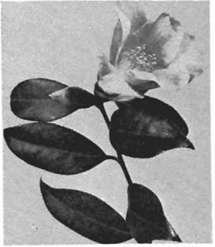
Camellia Williamsii 'Bow Bells'