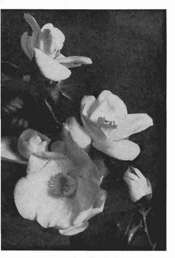
Camellia Williamsii 'Francis Hanger'

during late winter and early spring, depending much, of course, on the local climate and situation; the form of the flowers varies from funnelshaped to broadly bell-shaped or wider, the color from a bright rose to a soft pink or even white in a recent English hybrid ('Francis Hanger'). The flowers are produced generously in long succession from the upper leaf axils of short branches, in Seattle usually from mid-February into April, although occasionally we have seen blooms in late November or early December if the weather has been particularly favorable; in that case they would overlap with C. Sasanqua. Normally they precede al-