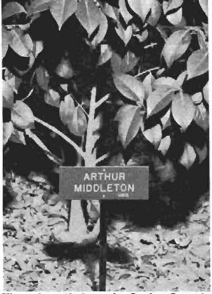
Through a gift from the Garden Committee, camellias at the Huntington Gardens are now distinguished by the type of label shown above. The name of each variety is deeply etched in black plastic by a special process, resulting in a clear and attractive label.